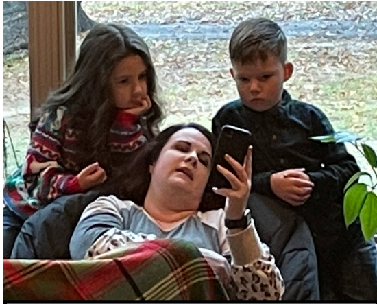
My niece reading the booklets to her niece & nephew.

For many years I have written Gospel material. My target audience - those who have never heard the Gospel message, never prayed and never had an evangelistic encounter with someone who loves Jesus. The material must be easy to read, interesting, relatively short, evangelistic and apologetic.